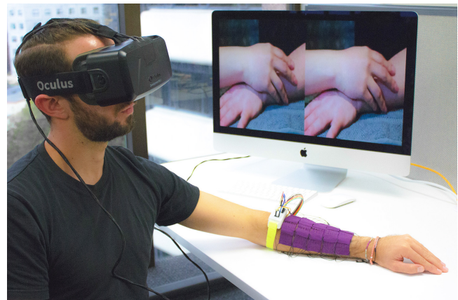
Figure 1: A user is experiencing the touch of another hand on his own arm in VR environment

In our work, we aim to recreate phantom touches that appear to be initiated by another person, in order to enrich VR experiences. To possibly create these touch illusions, we browsed literature and determined SMA as the technology of choice, since it provides a