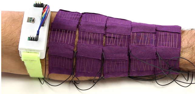
Figure 2: The PhantomTouch prototype: A plasters matrix augmenting the forearm using 15 plasters.

For our prototype, we selected the SMA wire: BMF150 SMA. According to the data sheet, our wire contracts to a predefined length when heated up to 70°C. This contraction is 4% of the total length of the wire and can be used to apply a force equivalent to 144gf (1.44N), when the recommended current of 340mA is applied. For activation we maintained the current in each patch for 1 second. The ability of SMA wires to contract enables a variety of actuation possibilities. We stitched the wire into a sticky cloth patch (Kinesiology Muscle Tape). This generates shear forces along the skin as shown. This shear forces subtly deforms the skin and hence generates touch sensations.